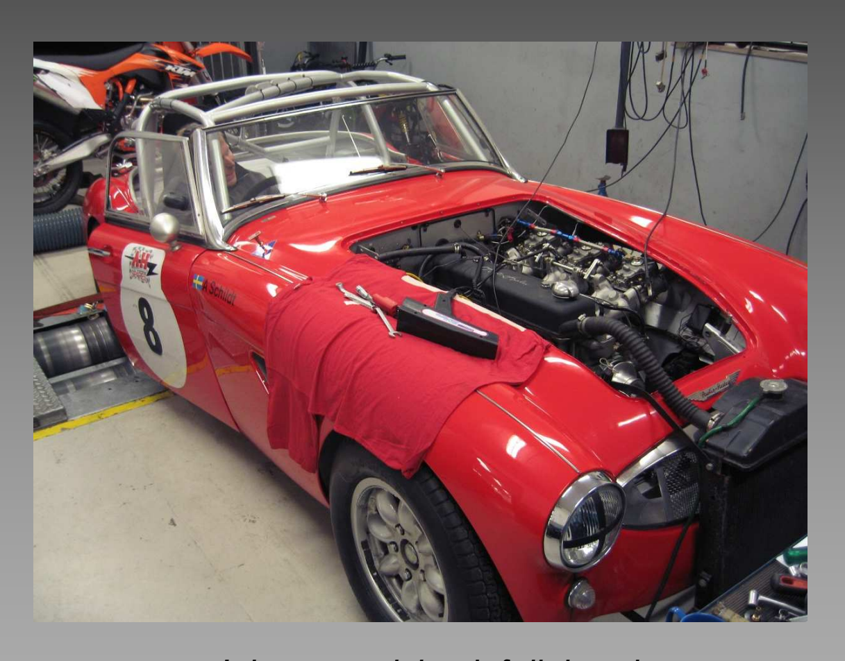
Johannes giving it full throttle 180 Km/H was recorded on the rollers!

Torque is up more than 10% with more to come.